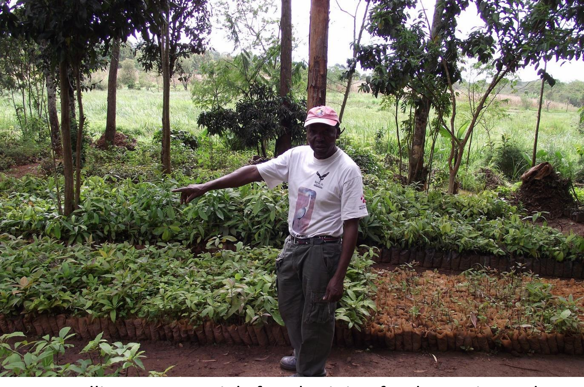
Tree seedlings – potentials for obtaining food security and wetland ecosystem restoration