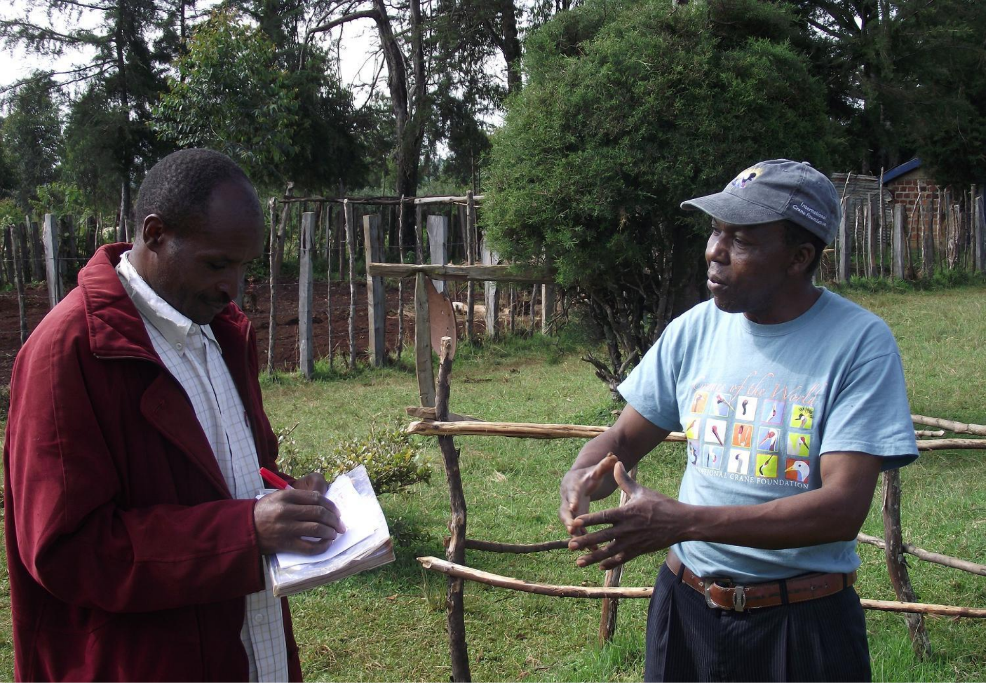
Sensitizing teachers first is part of required innovation