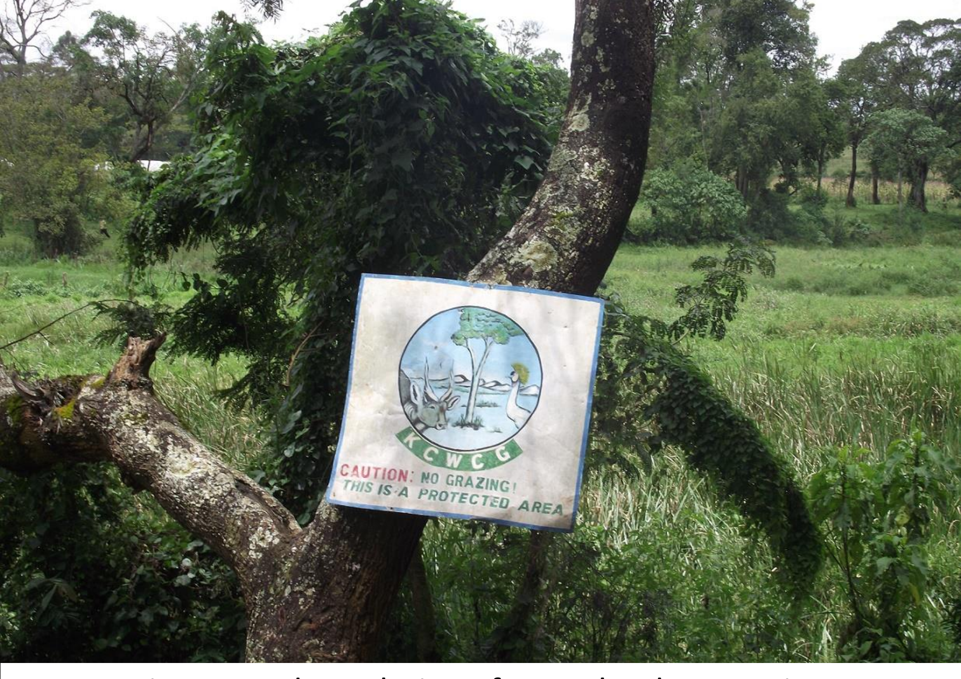
Community-agreed regulations for wetland protection