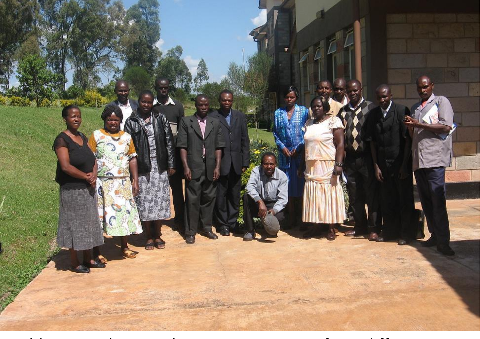
Building social networks - representatives from different sites