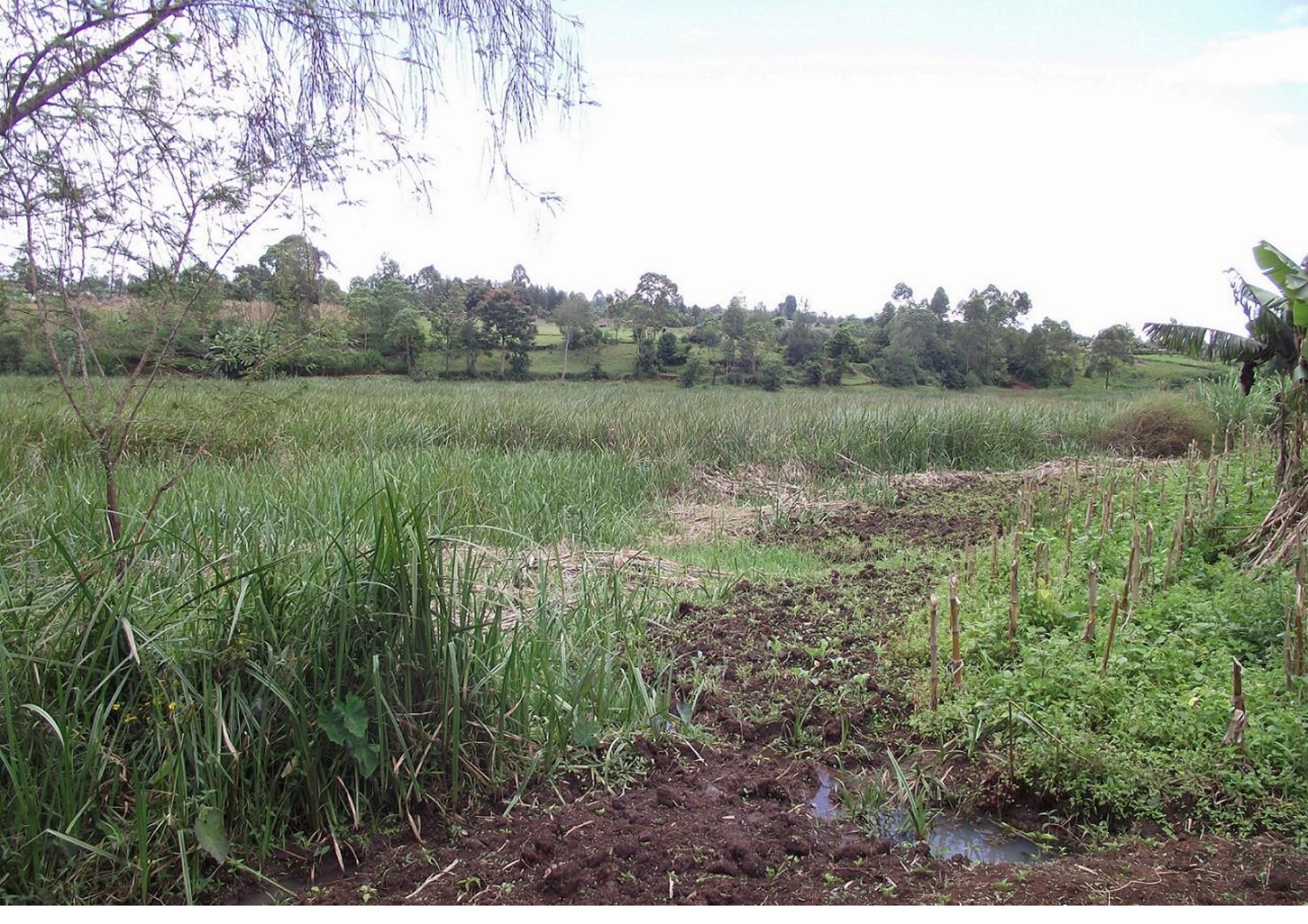
Wetland encroachment – the challenge being addressed