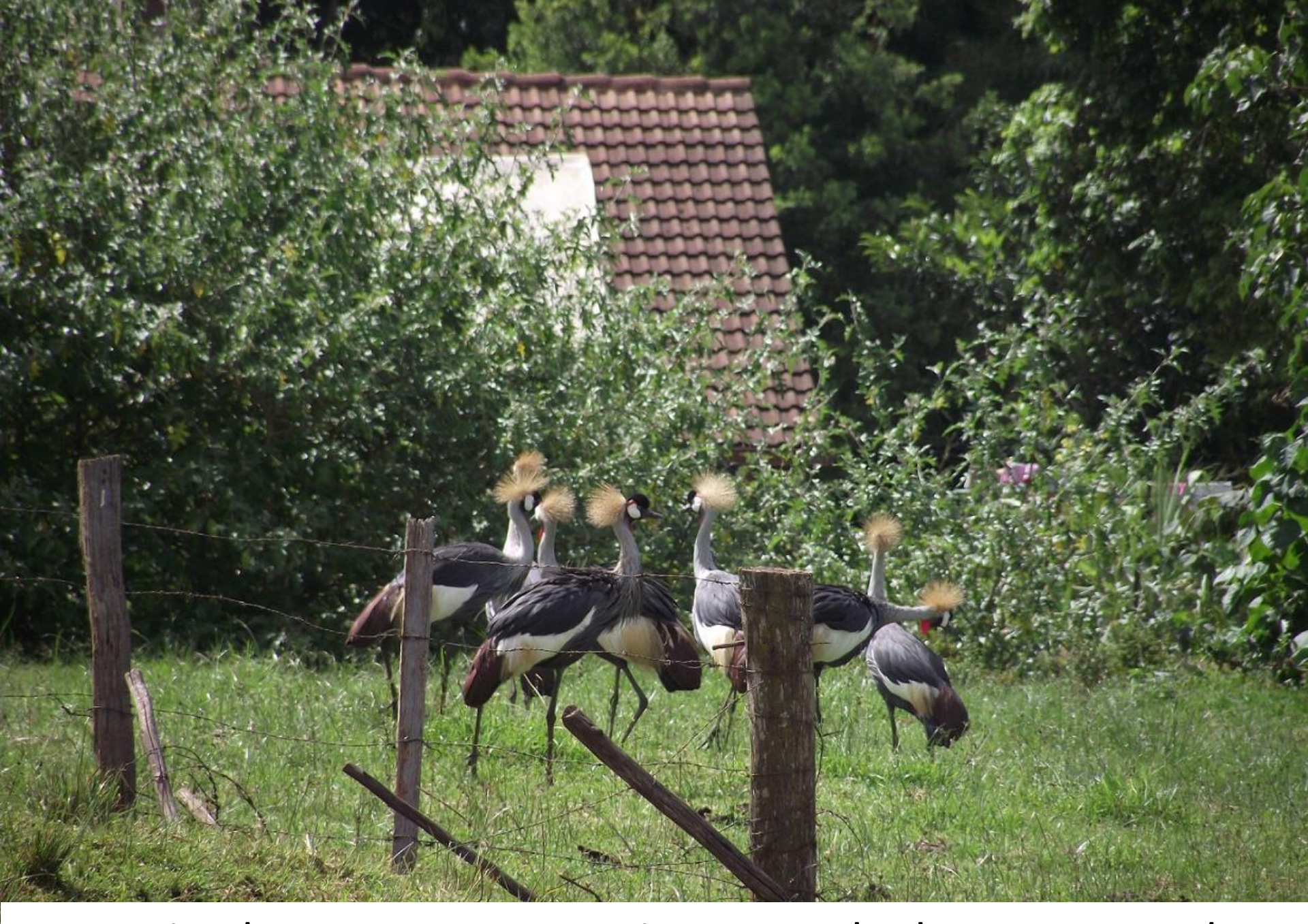
Promoting human-crane co-existence – the long-term goal