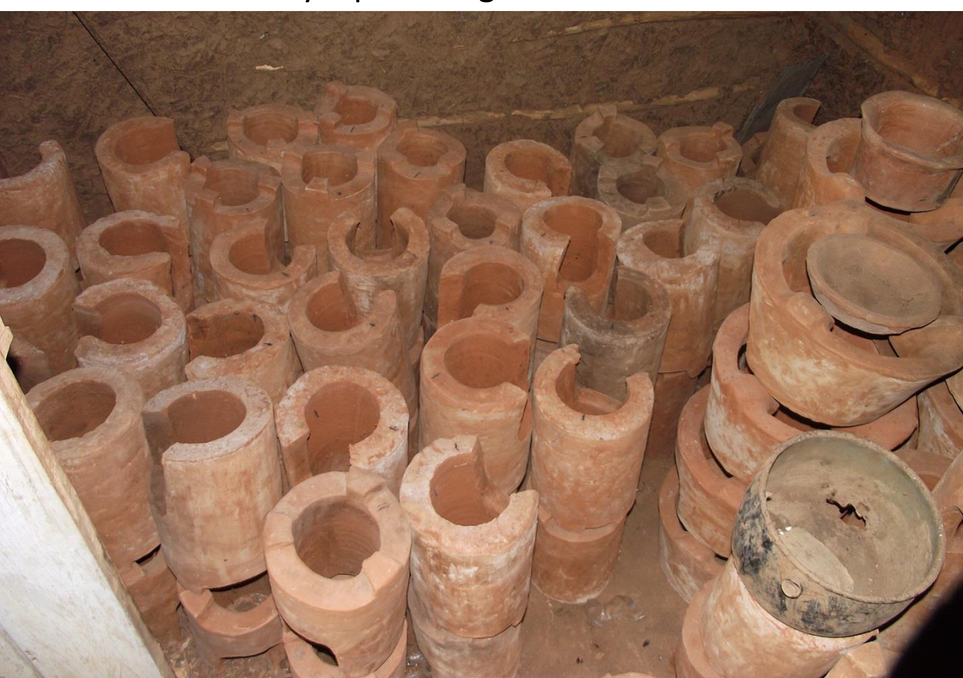
Jika stoves from clay – providing alternative livelihoods