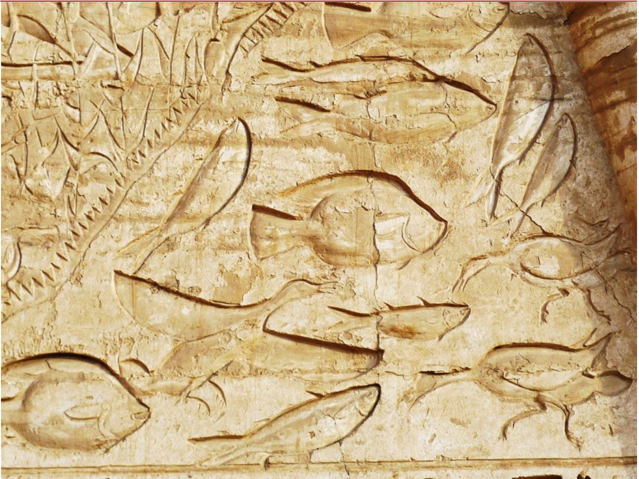
Figure 3. Animals of the Nile River shown on the relief can be attributed to certain species of fish (centre on top: Marcusenius cyprinoides ; upper right side: Eutropicus niloticus ; bottom centre: Alestes baremose ; centre and left lower margin: Oreochromis niloticus ) and geese (cf. Anser anser ).

killed. The pharaoh himself is the one who kills the animals, though he is supported by a large group of hunters, lined up below the scene.