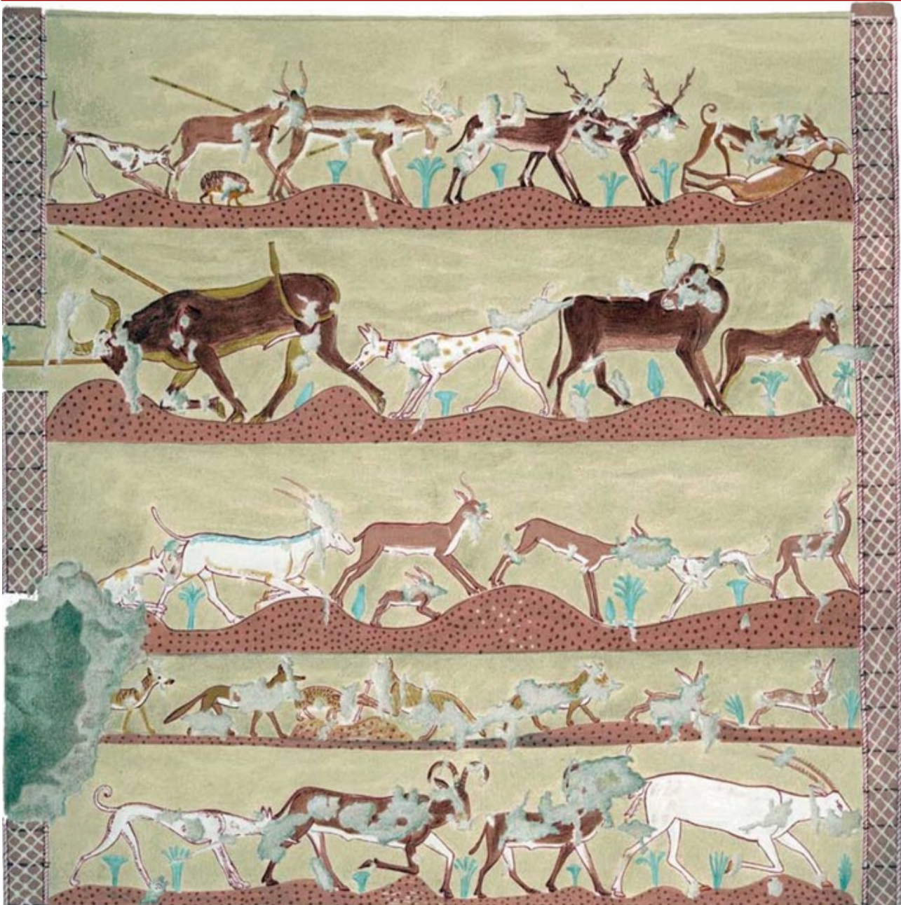
Figure 5. Hunting scene in the tomb of Antefoker (1958–1913 BC) in Thebes (tomb number TT60) from the beginning of the 12 th dynasty. In the second row, a male aurochs is hit by a spear and attacked by a hunting dog. The female animal (turning her head back) and the calf are allowed to escape. Species in this scene include: Alcelaphus buselaphus buselaphus , Dama dama mesopotamica , Bos primigenius , Oryx leucoryx , Gazella dorcas dorcas , Vulpes vulpes , Lepus capensis , and Ammotragus lervia .

species has mainly been passed on in tales and myths (van Vuure 2002).