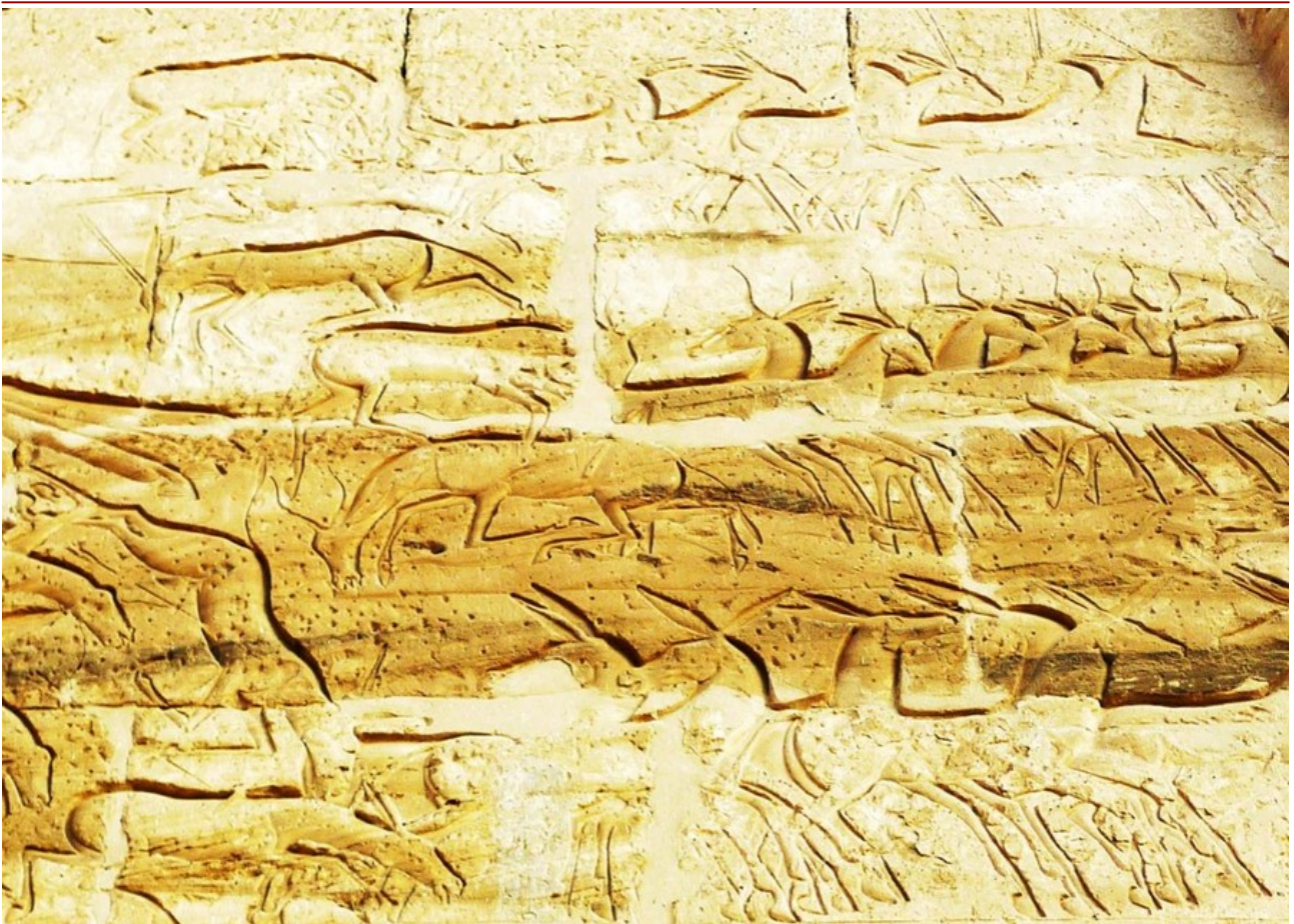
Figure 4. In the same relief at Medinet Habu, several herds of other herbivores are shown ( Oryx dammah or leucoryx , Equus africanus , Alcelaphus buselaphus buselaphus ). The lioness, which is attacking a wild donkey, indicates that this scene did not take place in captivity.

There appears to have been a change in hunting practice over time. In the scene at Medinet Habu, two juvenile animals are killed. Older scenes of ‘hunting in the desert’ only show the killing of adult bulls, whereas cows and juvenile animals were allowed to escape (Manlius 2000) (Fig. 5). In the Egyptological context, ‘desert’ refers to natural ecosystems outside the agricultural landscape and settlements. Like in Mesopotamia, the hunting of aurochs was carried out with horse-drawn chariots, arrows and spears, sometimes supported by dogs. Hunting with horses is impressively portrayed on Tutankhamun's hunting chest lid (Sandison 1997).