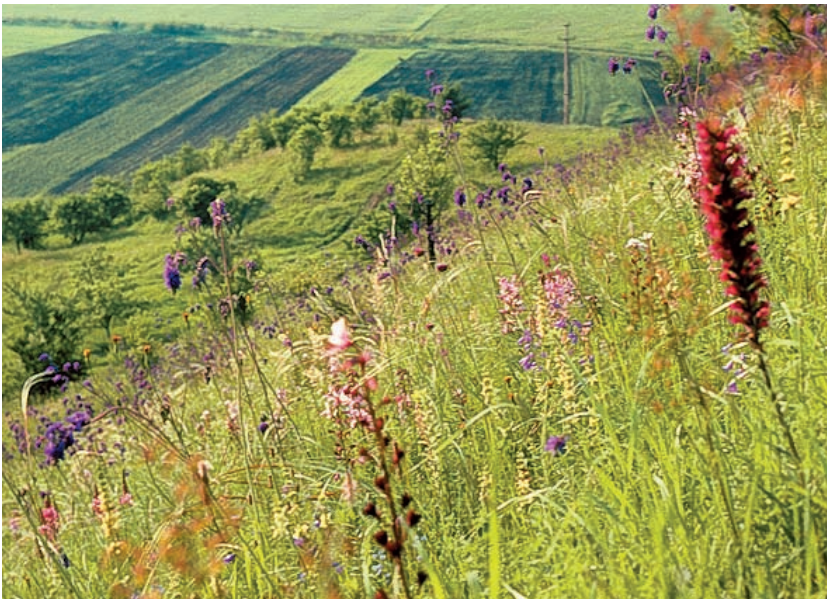
Fig. 3: Species-rich stand of the Stipetum pulcherrima with Echium russicum , Salvia nutans , Dictamnus albus , Stachys recta , Verbascum phoeniceum , and Campanula sibirica near Mociu (Photo: Eszter Ruprecht, May 2001).