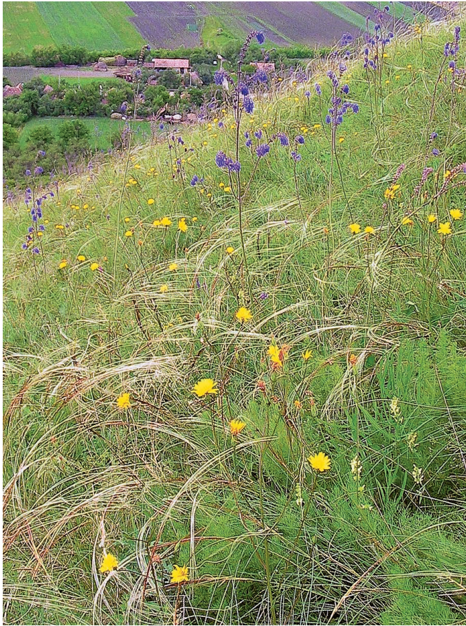
Fig. 4: Long-term abandoned stand of the Stipetum pulcherrimae with Salvia nutans , Leontodon crispus , and Adonis vernalis near Suatu (Photo: Mónika Deák, May 2003).

Abb. 4: Vor langem brach gefallener Bestand des Stipetum pulcherrimae mit Salvia nutans , Leontodon crispus und Adonis vernalis bei Suatu (Foto: Mónika Deák, Mai 2003).