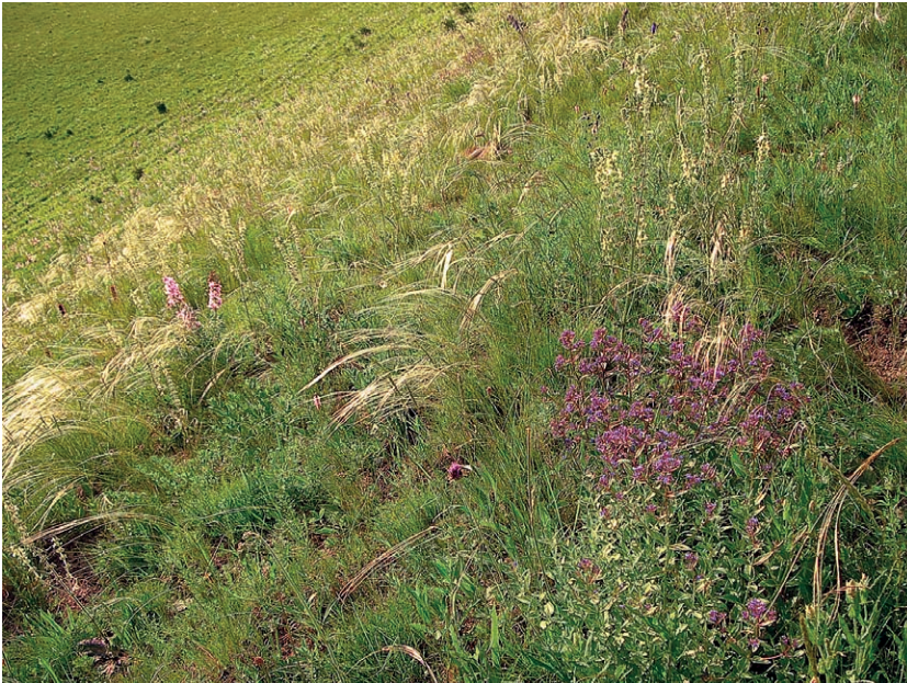
Fig. 2: Extensively grazed stand of the Stipetum lessingiana with Nepeta ucranica near Valea Florilor (Photo: András Kun, May 2003).