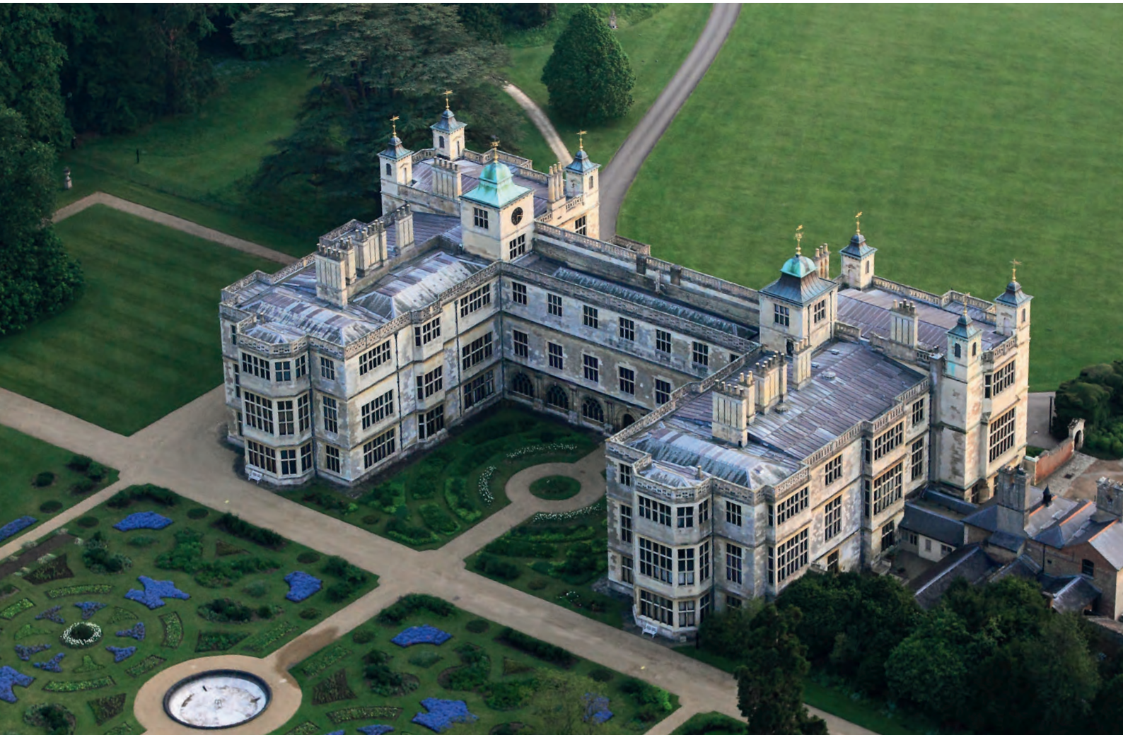
below: Audley End House