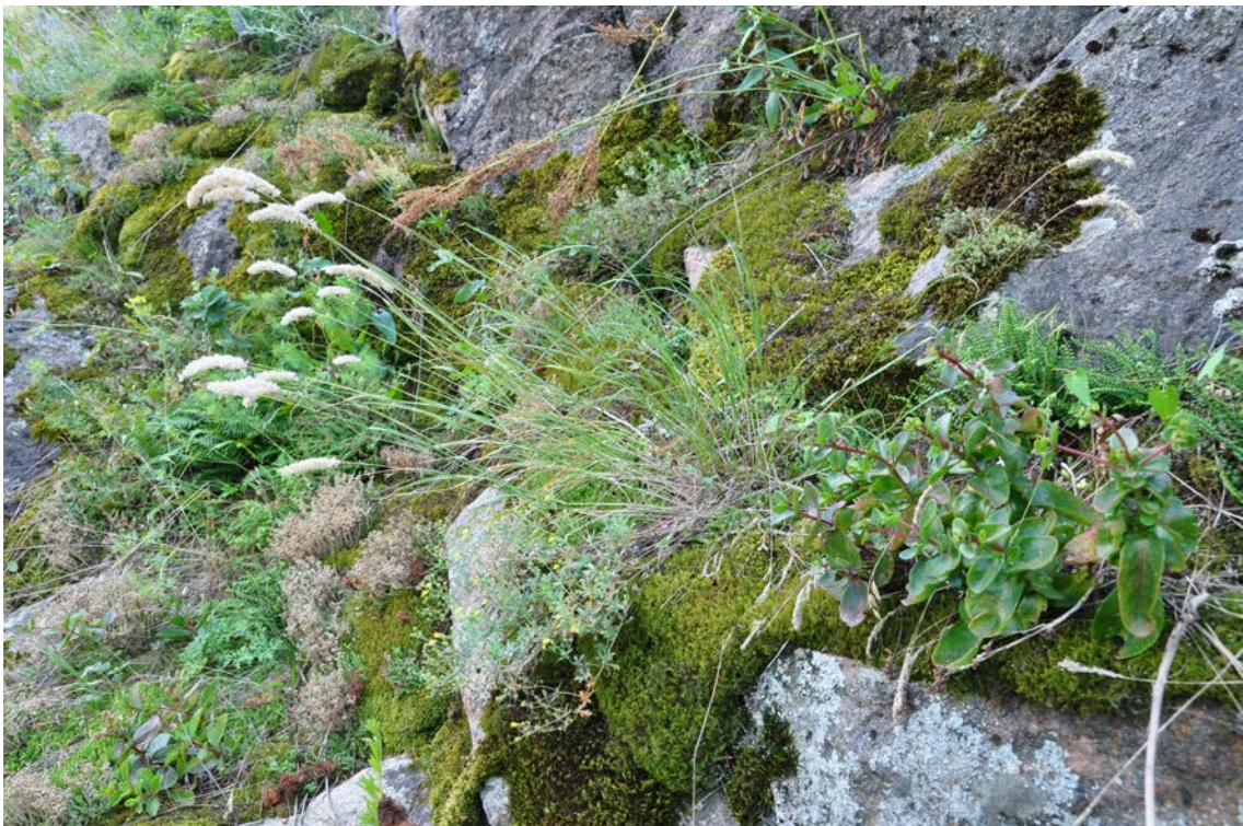
Allium podolicum - Sedum acre [ Sedo albi - Veronicion dillenii ?] community (1.2.1), Granite outcrops near Antsipolivka village (Site 3).