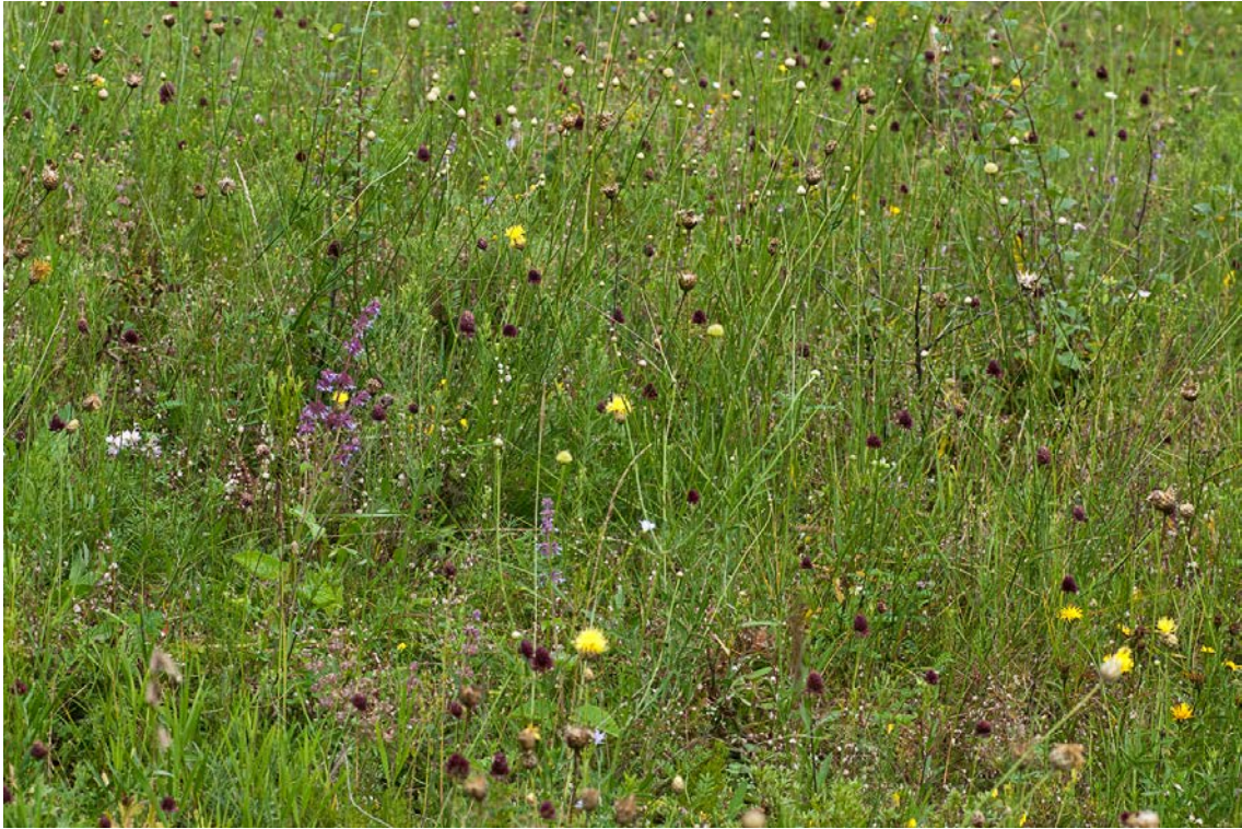
Salvia nutans-Carex humilis [ Stipion lessingianae ] community (2.2.3), Limestone outcrops near Faihorog village (Site 12).