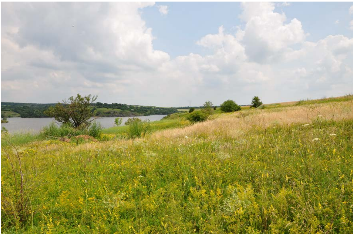
Fissidens viridulus-Festuca rupicola [ Agrostio vinealis-Avenulion schellianae ] community (2.1.2), Granite outcrops near Antsipolivka village (Site 3).