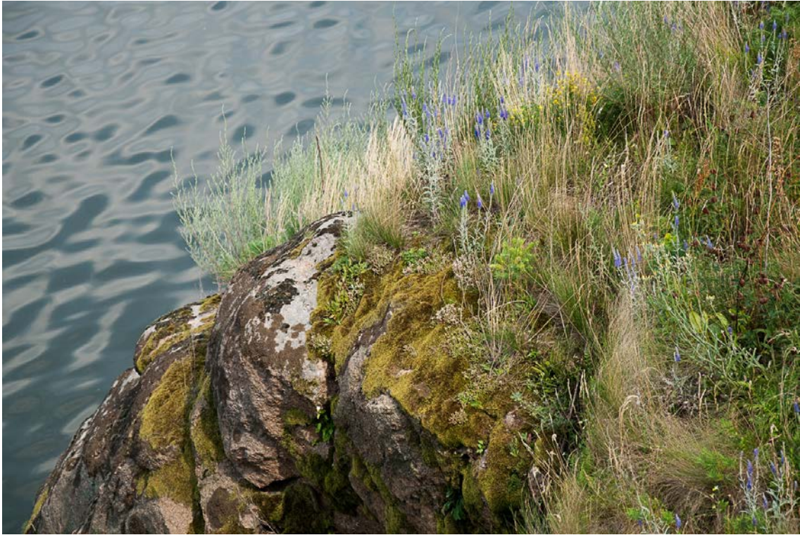
Allium podolicum - Sedum acre [ Sedo albi - Veronicion dillenii ?] community (1.2.1), Granite outcrops near Antsipolivka village (Site 3) (Photo: J. Dengler, JD103425).