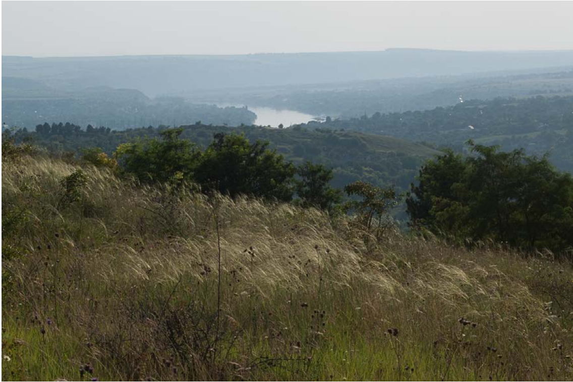
Teucrio pannonici-Stipetum capillatae (2.2.1), Locality “Ozarynetska mountain” in Nemya river valley near Mohyliv-Podilsky town (Site 17) (Photo: J. Dengler, JD104630).