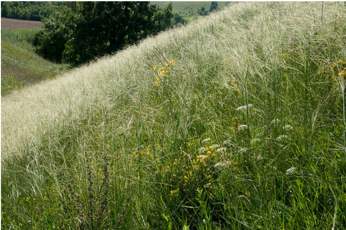
Teucrio pannonici-Stipetum capillatae (2.2.1), Carlina onopordifolia site “Romashkovo” (Site 6) (Photo: J. Dengler, 103737).