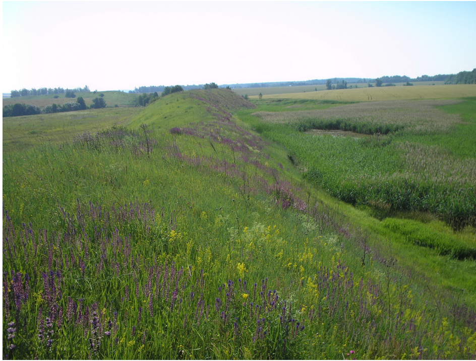
Fig. 3. Fissidens viridulus-Festuca rupicola [ Agrostio vinealis-Avenulion schellianae ] community (2.1.2), ancient settlement “Nemyrivske” (Site 1).