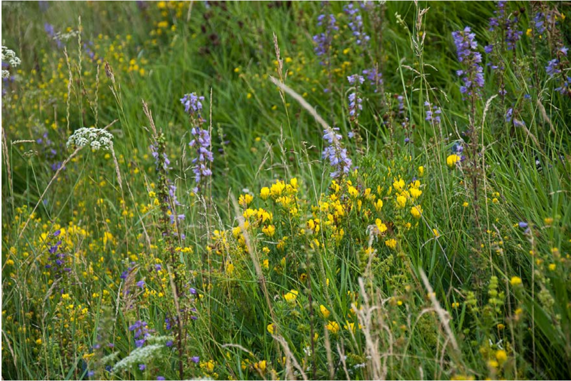
Fissidens viridulus-Festuca rupicola [ Agrostio vinealis-Avenulion schellianae ] community (2.1.2), Granite outcrops near Antsipolivka village (Site 3).