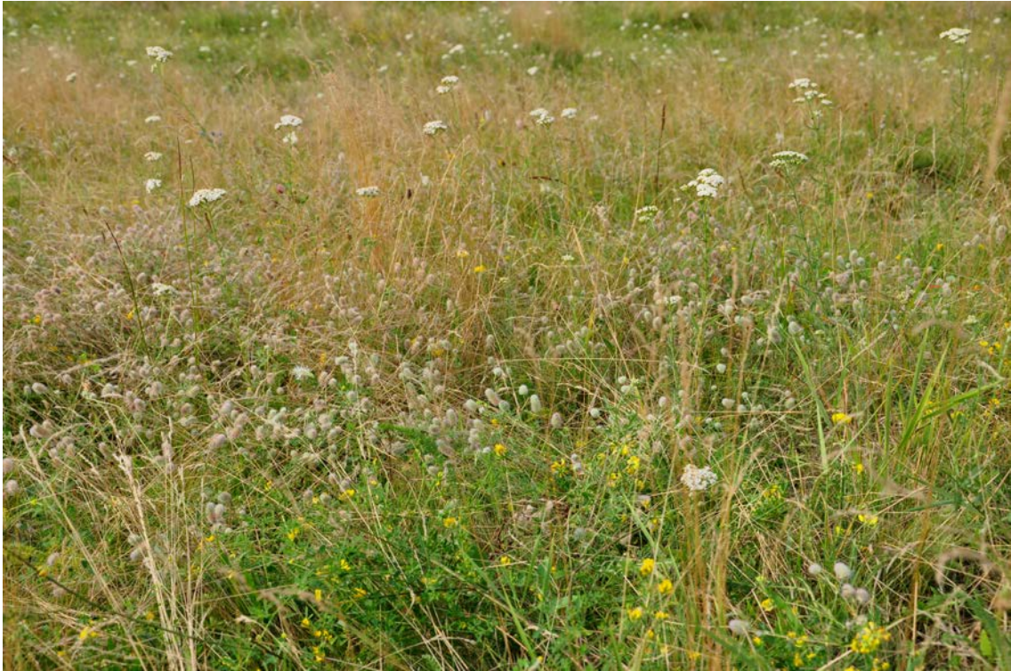
Homalothecium lutescens-Poa angustifolia [ Agrostio vinealis-Avenulion schellianae ] community (2.1.3), Pasture on the sand basis near Ternivka village (Site 13).