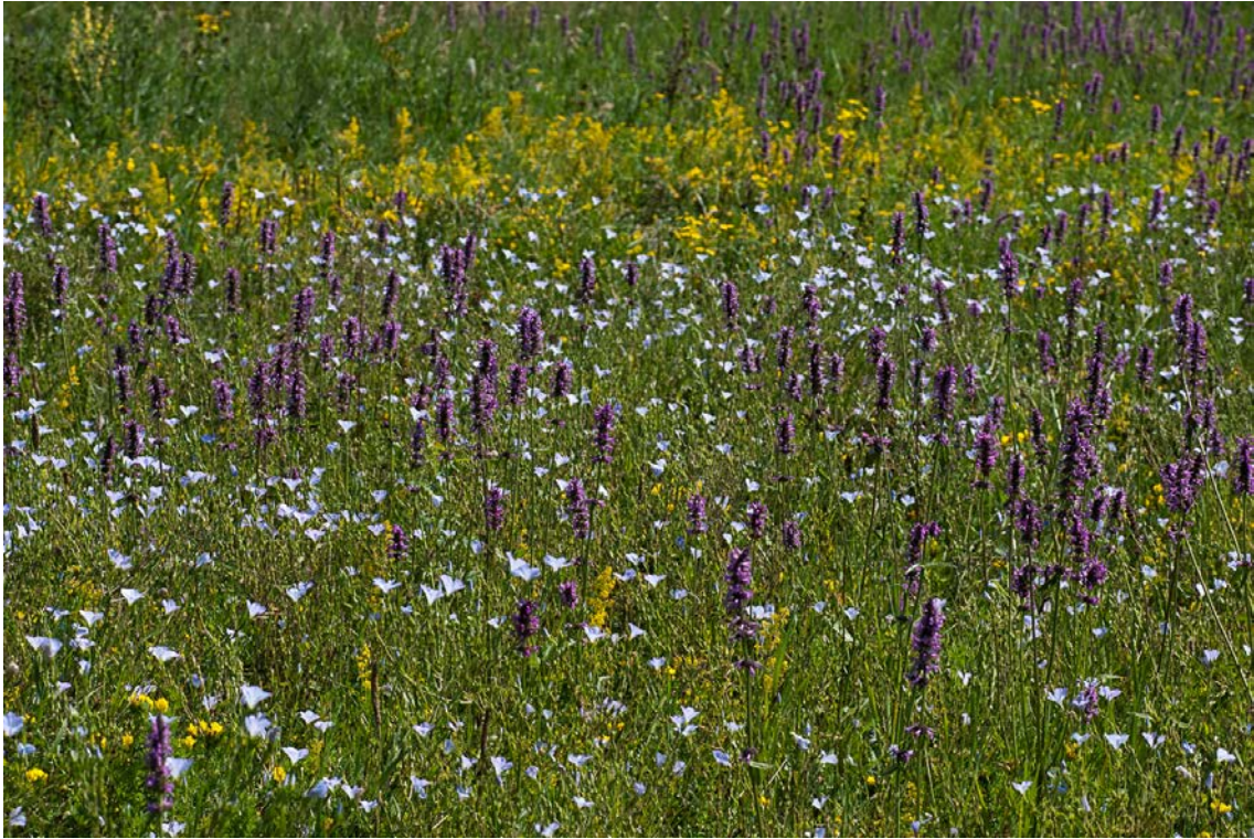
Linum hirsutum-Galium verum [ Agrostio vinealis-Avenulion schellianae ] community (2.1.1), Carlina onopordifolia site “Romashkovo” (Site 6).