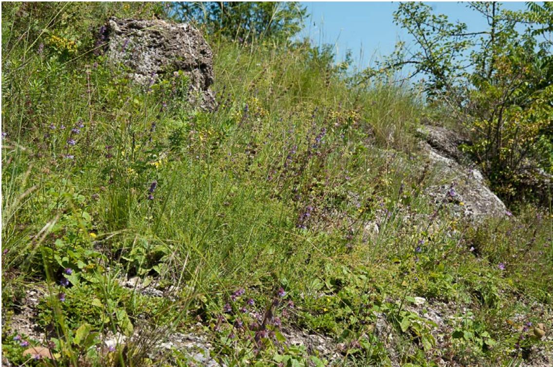
Allio taurici-Dichanthietum ischaemi (2.2.2), Kamianka river valley between villages Bolgan and Kukuly (Site 8).