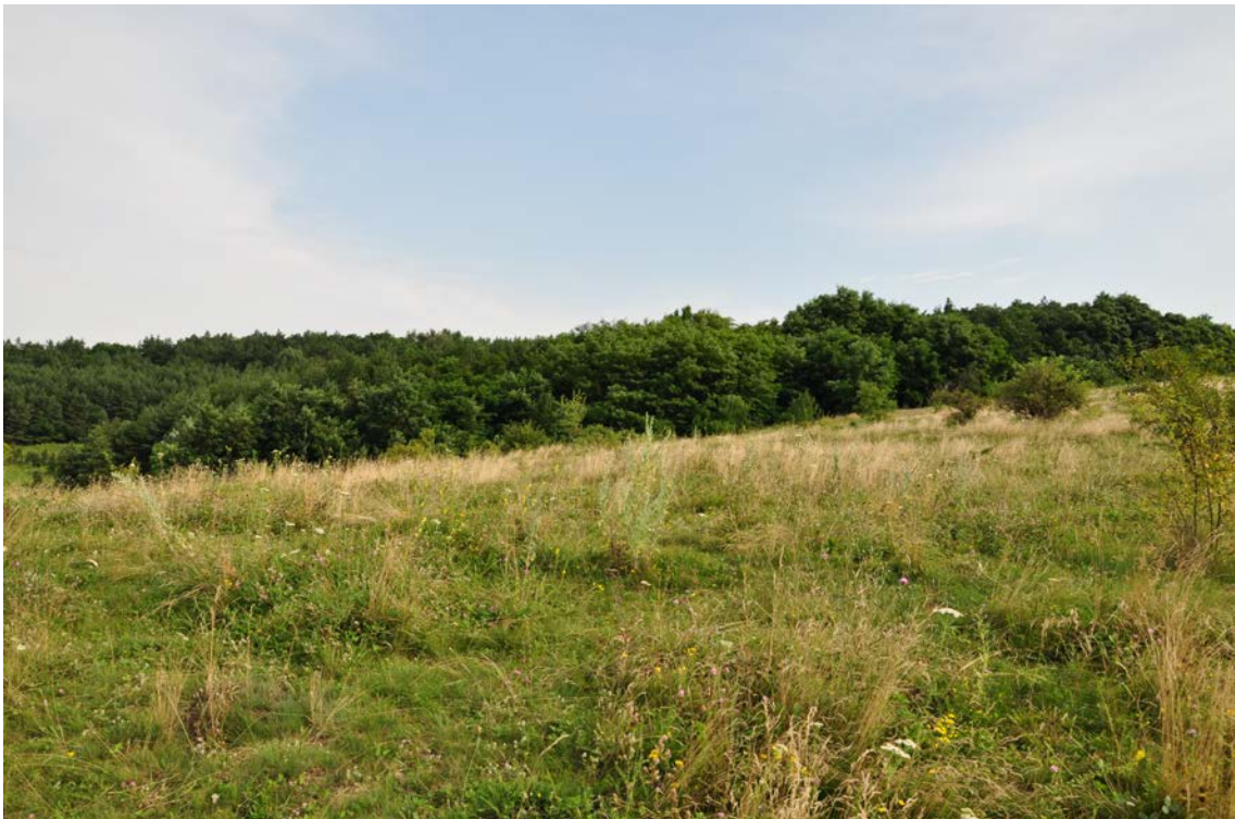
Homalothecium lutescens-Poa angustifolia [ Agrostio vinealis-Avenulion schellianae ] community (2.1.3), Pasture on the sand basis near Ternivka village (Site 13).