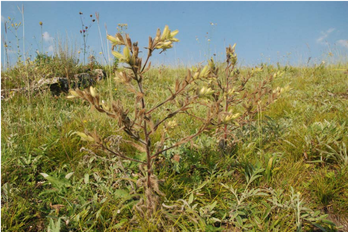
Salvia nutans-Carex humilis [ Stipion lessingianae ] community (2.2.3), Vilshanska river valley near Verkhnia Slobidka village (Site 14).