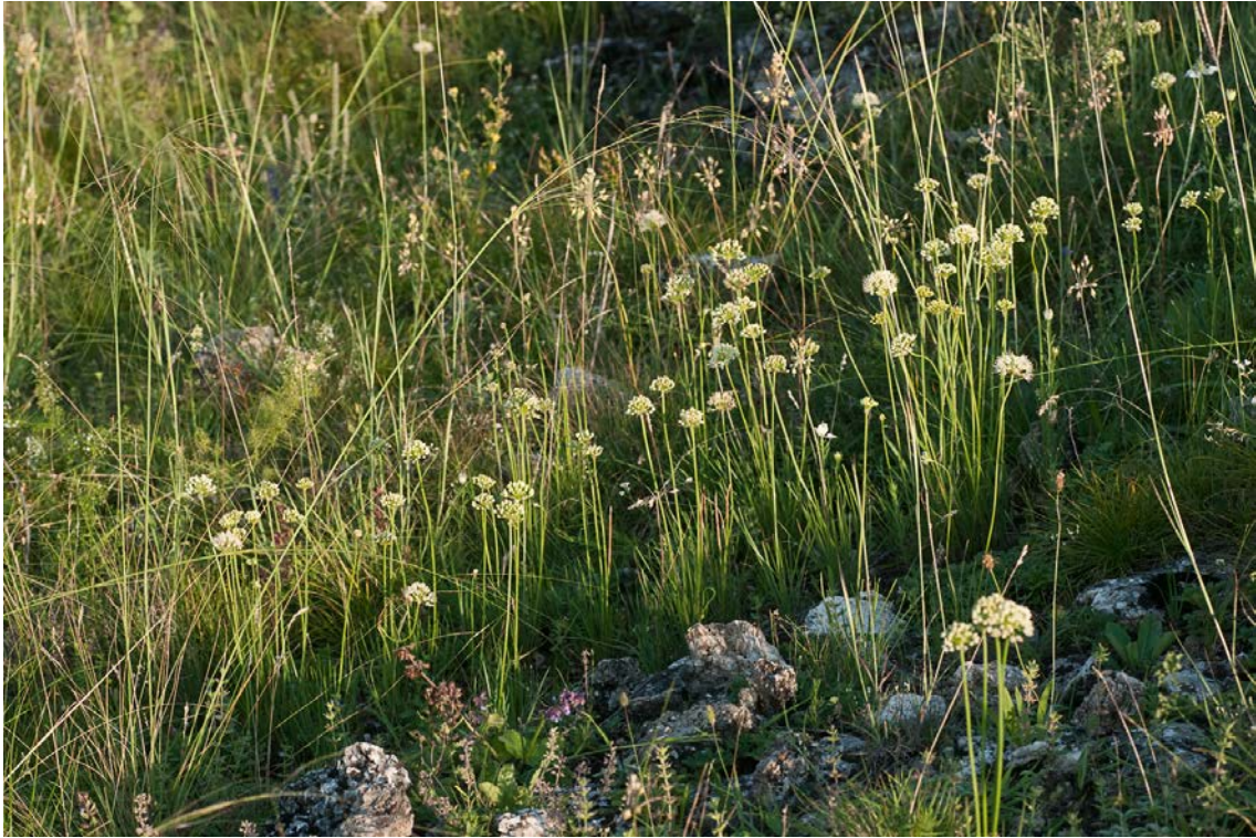
Allio taurici-Dichanthietum ischaemi (2.2.2), Kamianka river valley between villages Bolgan and Kukuly (Site 8).