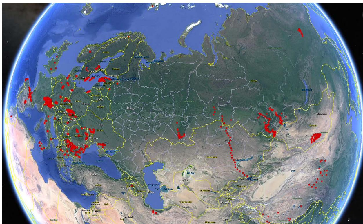
Fig. 1. Overall distribution of GrassPlot data (8 May 2017) in the Palearctic biogeographic realm (Source of base map: GoogleEarth).