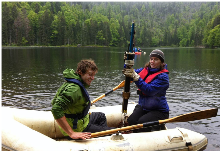
Environmental Chemists investigate air pollution, greenhouse gas emissions, or contamination of soil, water, and plants.