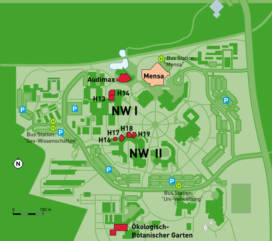
Map of the University: